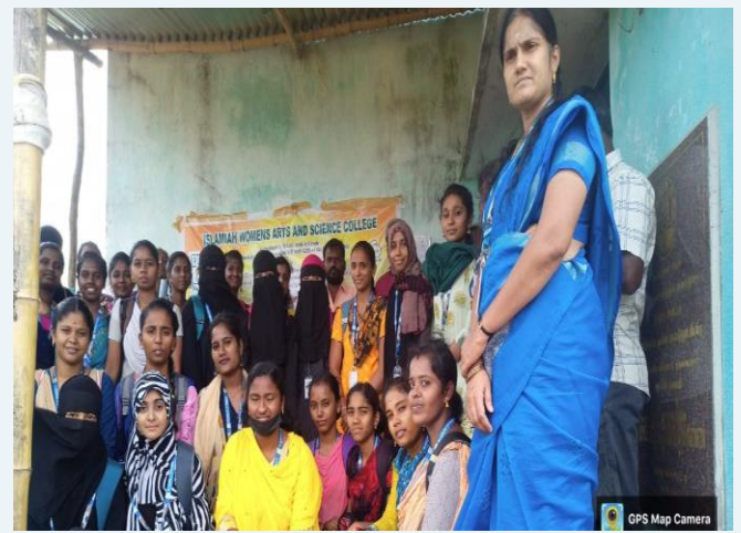
CAMPUS AND VILLAGE CLEANING KRISHNAPURAM VILLAGE