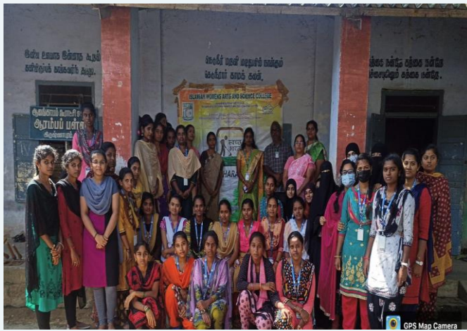
SWACHH BHARAT ABIHIYAN AWARENESS ON SINGLE USE OF PLASTICS